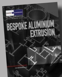
Bespoke Aluminium Extrusions