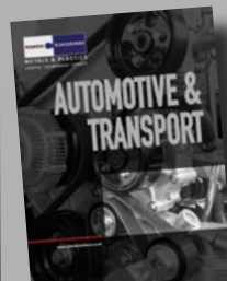
Automotive & Transport