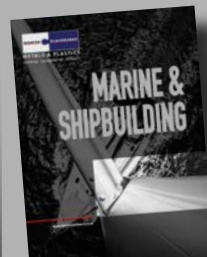
Marine & Shipbuilding