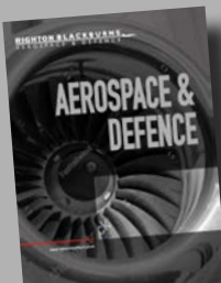
Aerospace & Defence

For further information on the full range of products we supply into our specialist markets, please contact your local Service Centre to request a copy of the brochures dedicated to those specific markets.