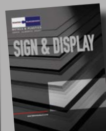
Sign & Display